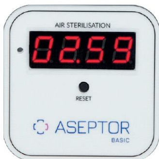
C - advanced working-time LED counter in ASEPTOR Basic