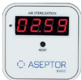
C - advanced working-time LED counter in ASEPTOR Basic