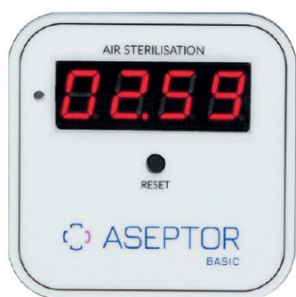
C - advanced working-time LED counter in ASEPTOR Basic