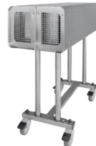
ON MOBILE STAND