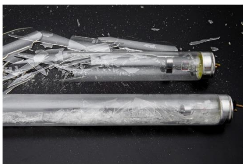
Anti-splashing foil protection