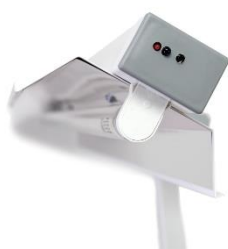
Digital counter with acoustic signalling, without the display