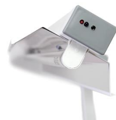
Digital counter with acoustic signalling, without the display