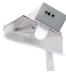
Digital counter with acoustic signalling, without the display