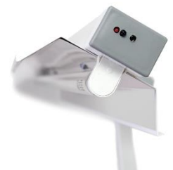
Digital counter with acoustic signalling, without the display