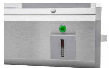
Inductive mechanical counter