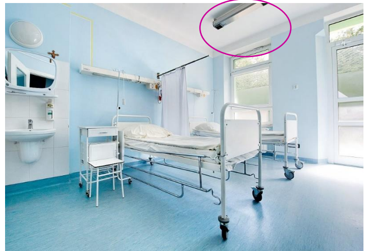
1.1 Ultra-Viol's realisation