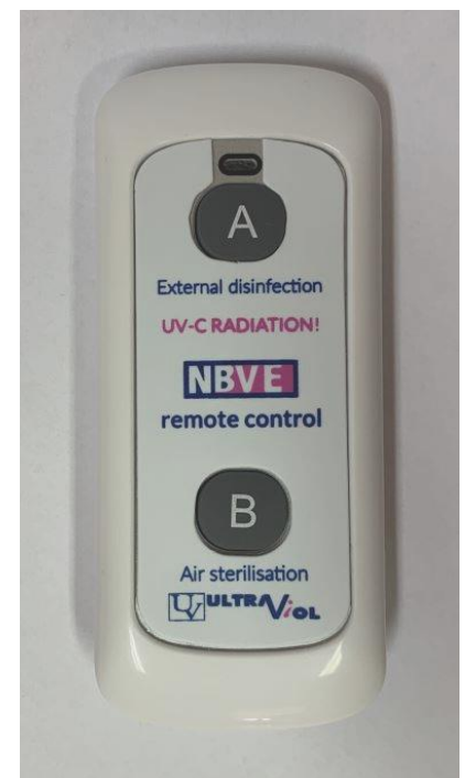
RC remote control provided with lamp