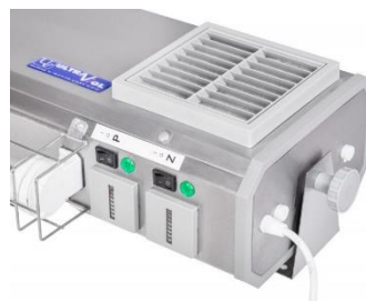
2 inductive mechanical counters