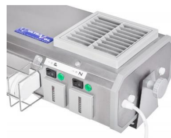
2 inductive mechanical counters