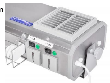
2 inductive mechanical counters