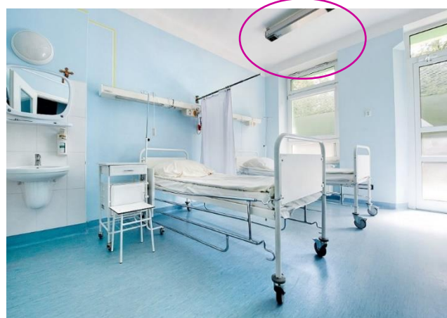
1.1 Ultra-Viol's realisation