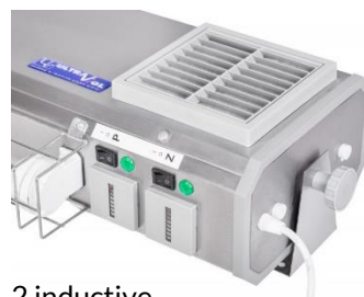
2 inductive mechanical counters