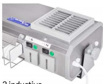
2 inductive mechanical counters