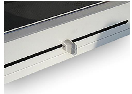
Shutter repositioning handle

NGP Z X-ray film viewers with shutters are medical devices designed for the analysis of radiographs, which is one of the basic methods of diagnosing human diseases. The devices are characterized by high luminous flux density, flicker-free, energy-saving high-frequency light for film reading without eyestrain. The devices do not come into contact with patients as they are devices supporting the process of analyzing X-rays by a doctor. The products are made in the 1st class of protection against electric shock. They can be used in operating theaters, doctor's offices, X-ray laboratories, etc.